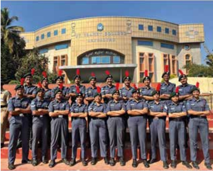
BATCH OF 2022-2025

The NCC Air Wing cadets of MS Ramaiah College appeared for the C Certificate Examination on 15th and 16th February 2025 at St. Claret Campus, Bengaluru. Day 1 focused on the practical exam, including drill tests, aeromodelling, flying, and rifle handling. Day 2 comprised the theory exam, assessing cadets on common subjects, special subjects, and general knowledge. The examination tested their skills, discipline, and expertise, marking a key milestone in their NCC journey.