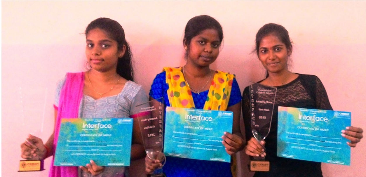
BSc(EMCs) students Won Intercollage competition conducted by Christ College 20-04-2016