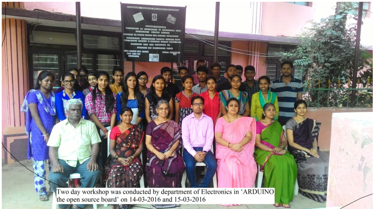
Two day workshop was conducted by department of Electronics in 'ARDUINO the open source board' on 14-03-2016 and 15-03-2016