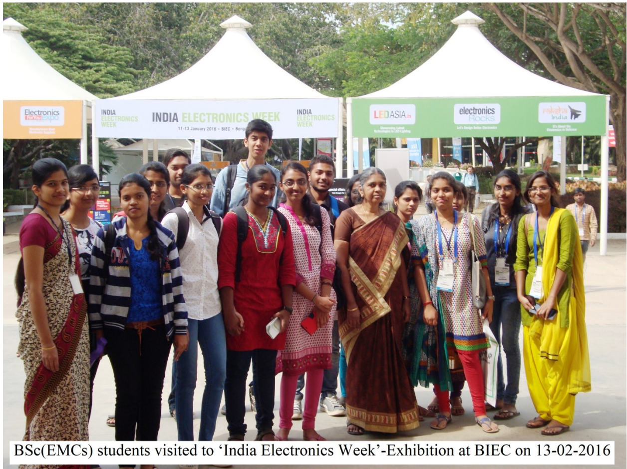
BSc(EMCs) students visited to 'India Electronics Week'-Exhibition at BIEC on 13-02-2016