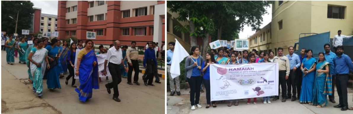
Awareness programme to enhance ground water by preventing wastage of water