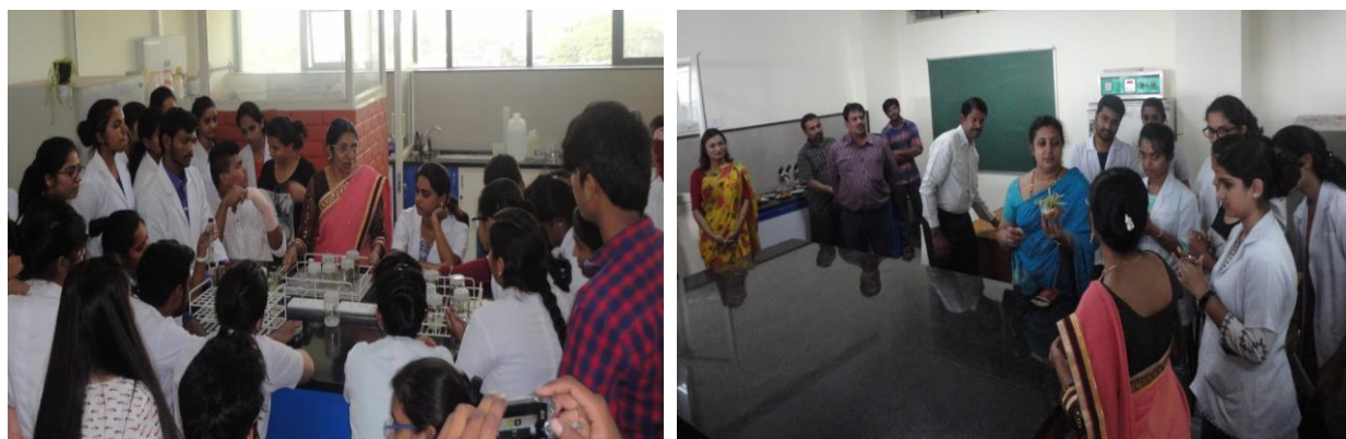
Work Shop on “Plant Tissue Culture”