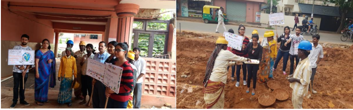
World Food Day was arranged to create awareness among construction worker