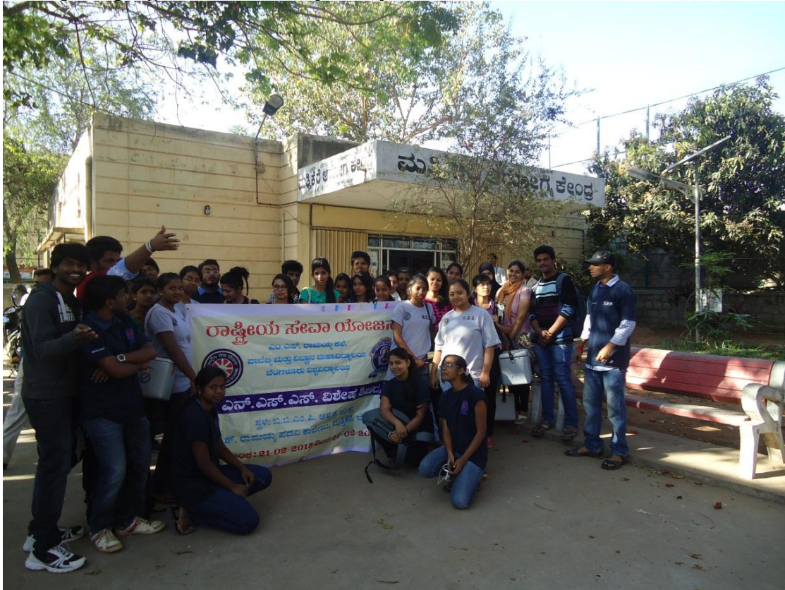
100 student volunteers from the college took part in activity in two rounds for national pulse polio awareness programme