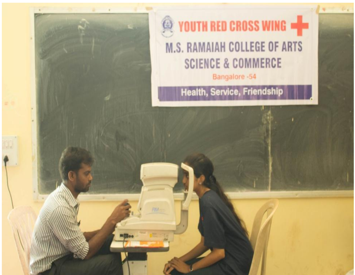
Eye Checkup Camp - 4 th September 2015