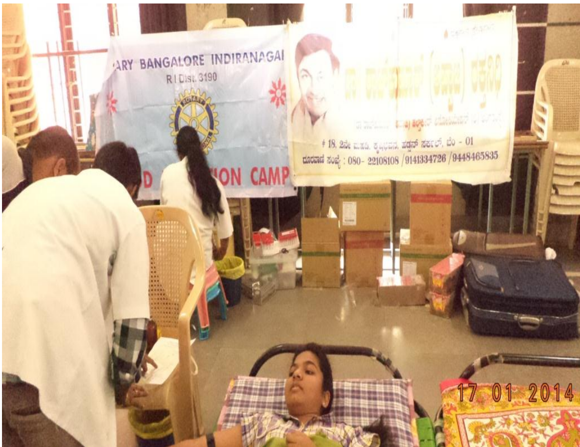
Blood Donation camp - 11 th September 2015