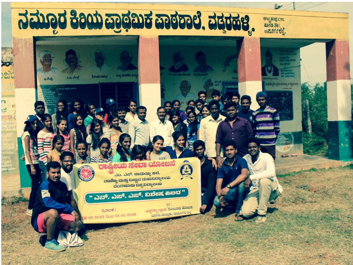
NSS CAMP - 26 th December 2015 to 1 st January 2016