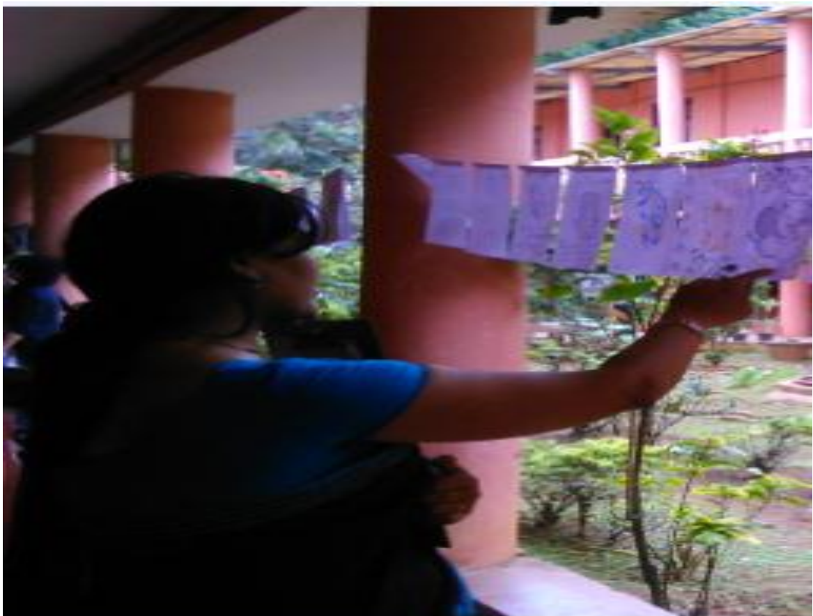
Eco Genesha Awareness - Pamphlet Making - 9 September 2015