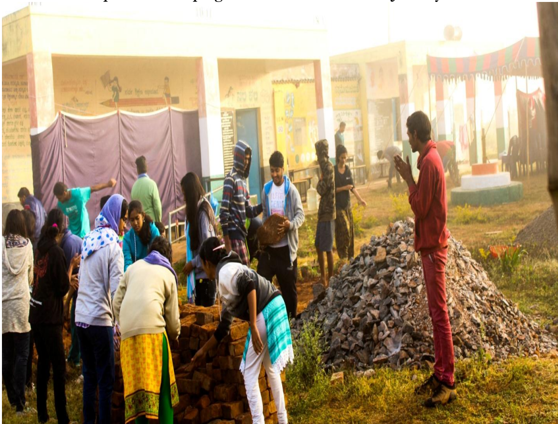
NSS CAMP - 26 th December 2015 to 1 st January 2016