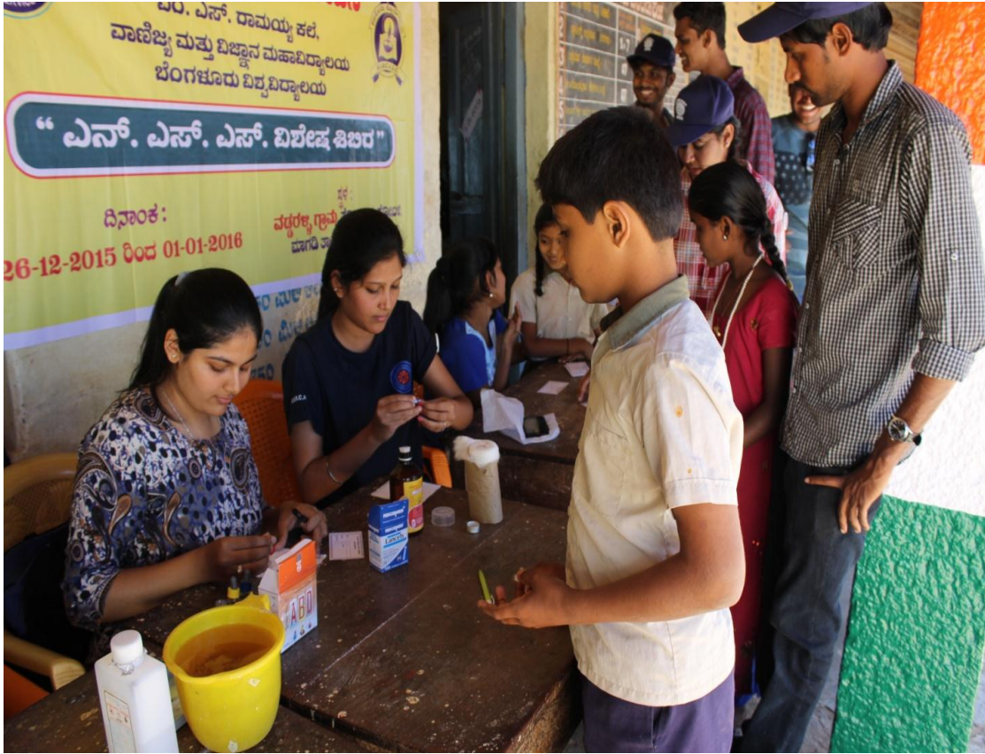
NSS Camp Blood Grouping 26 th December 2015 to 1 st January 2016