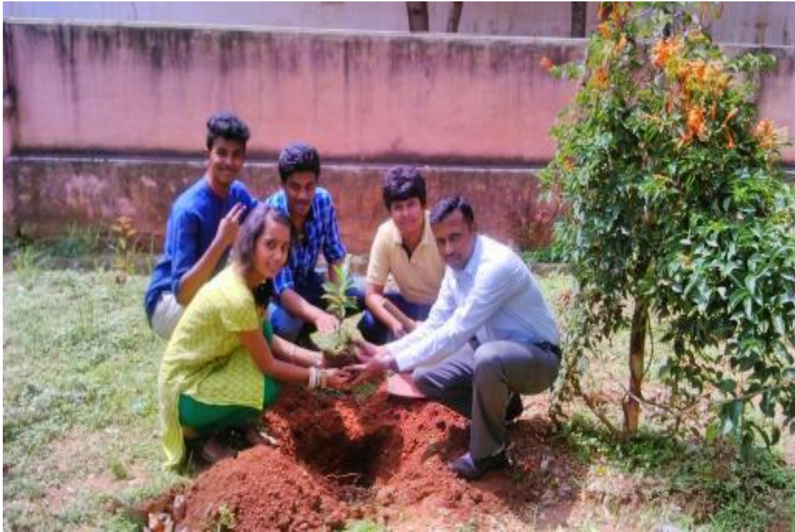
Tree planting activity - 12 January 2016