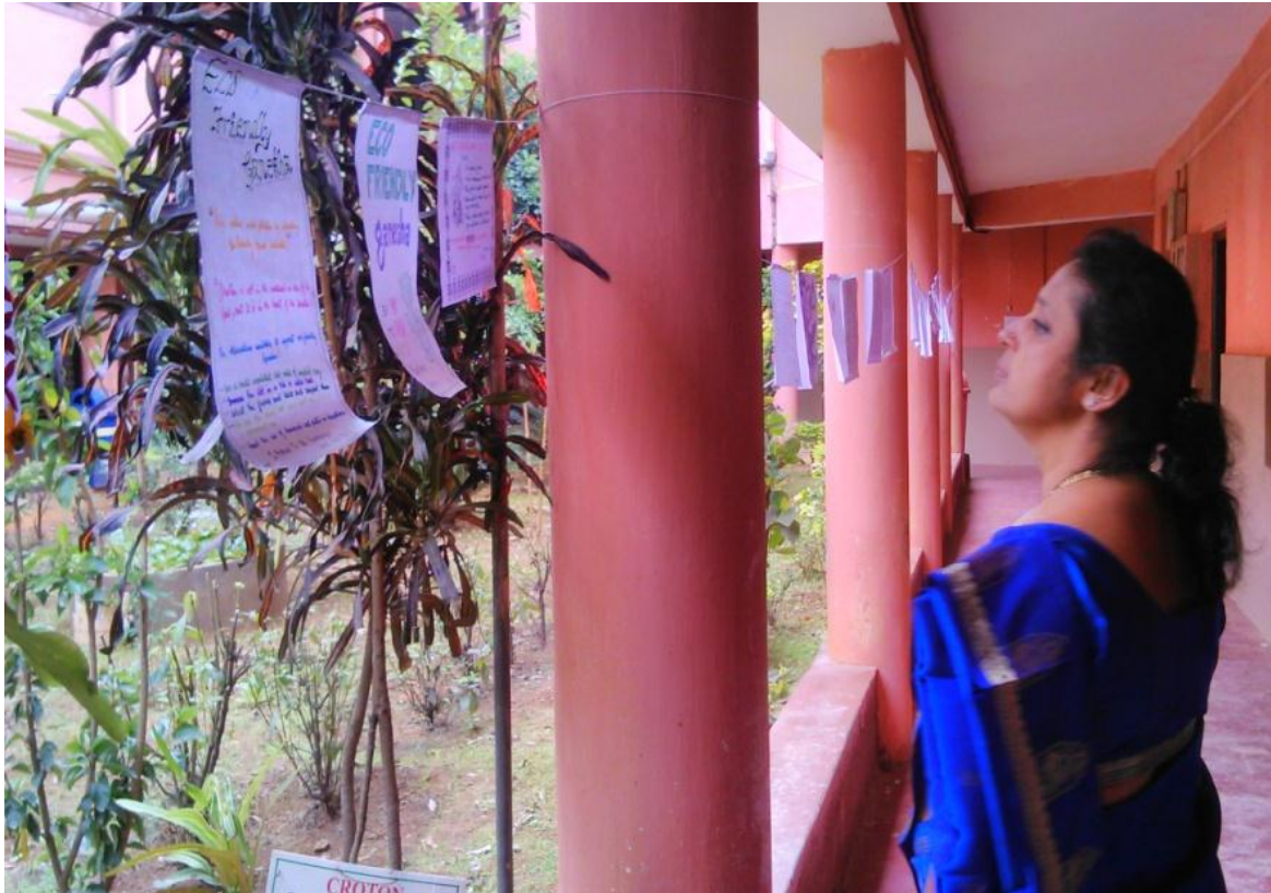
Eco Genesha Awareness - Pamphlet Making - 9 September 2015