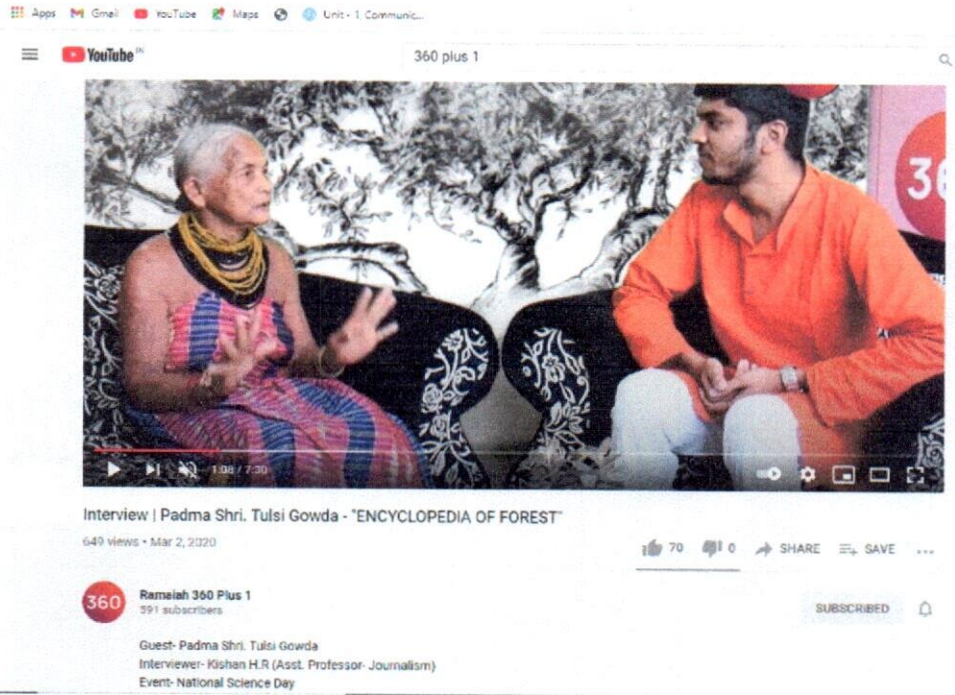
Interview Programme by “Ramaiah 360 0 + 1” with Padma Shri awardee Tulsi Gowda - "ENCYCLOPEDIA OF FOREST"