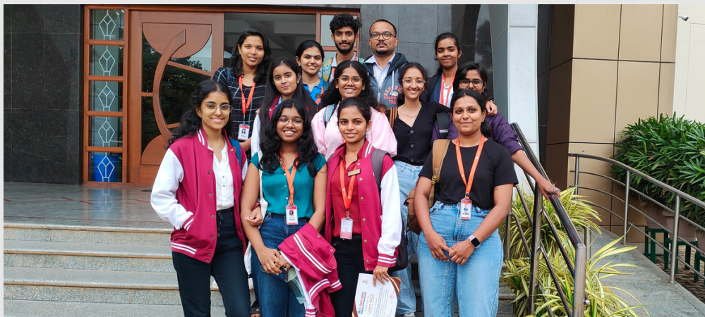
Paper presentation in St. Claret College - June 2023

Through these presentations, our students gain valuable insights, receive constructive feedback, and enhance their communication skills. Such accomplishments highlight the dedication, perseverance, and intellectual prowess of our students, positioning them as future leaders in their respective fields.