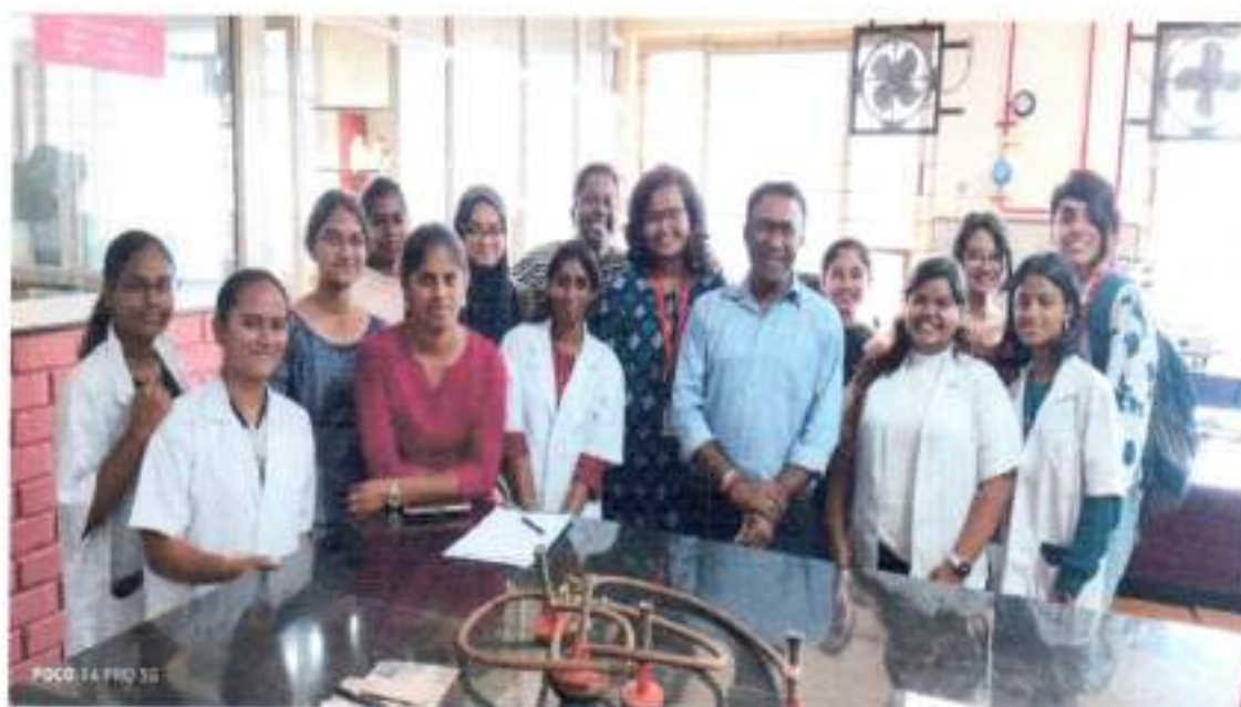
Students at the Microbiology Laboratory on the first day of Value added Course

The food samples analyzed for microbiological quality showed that there was moderate level of contamination. The students were assessed about food quality control, food standards, HACCP, by few MCQ.