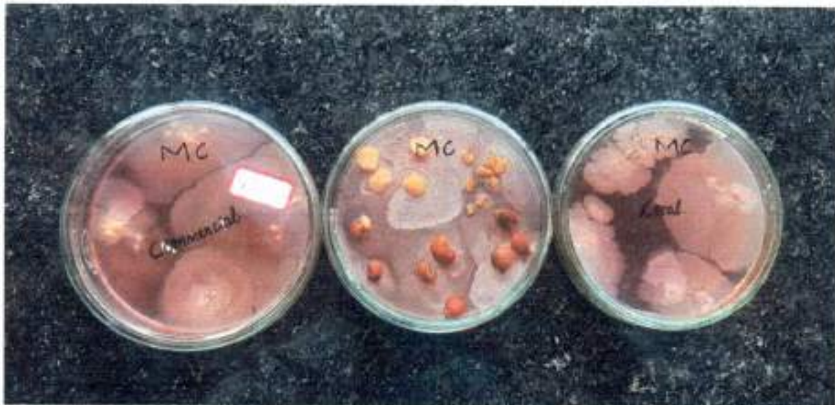
Isolation of Bacteria from raw pulses used in food preparations