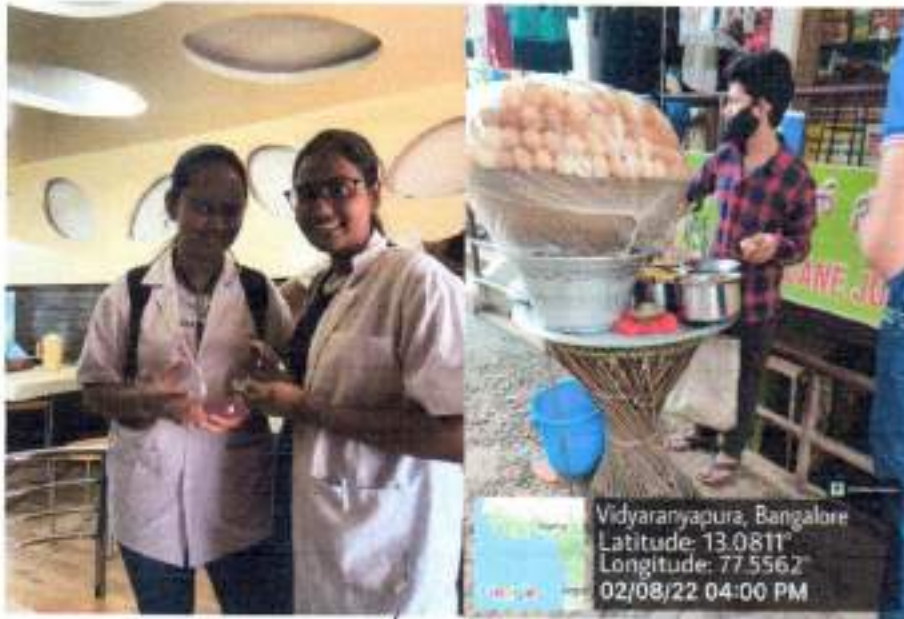
Air exposure at a food outlet | Sampling of the raw food ingredients