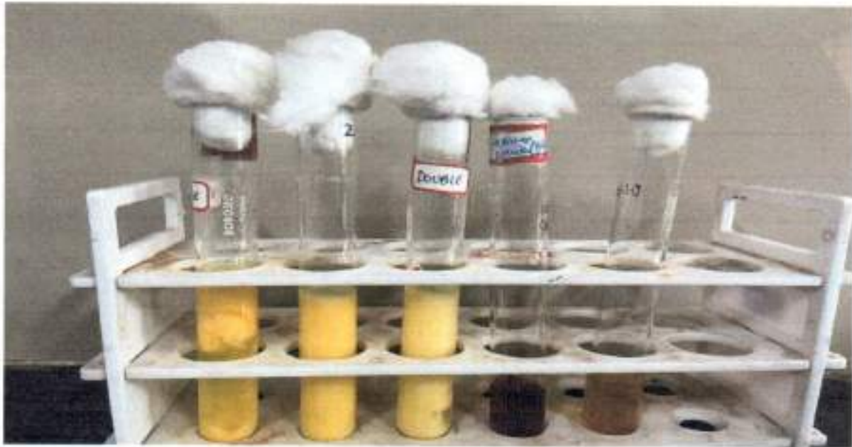
Most Probable Number method of Food analysis conducted for water and milk