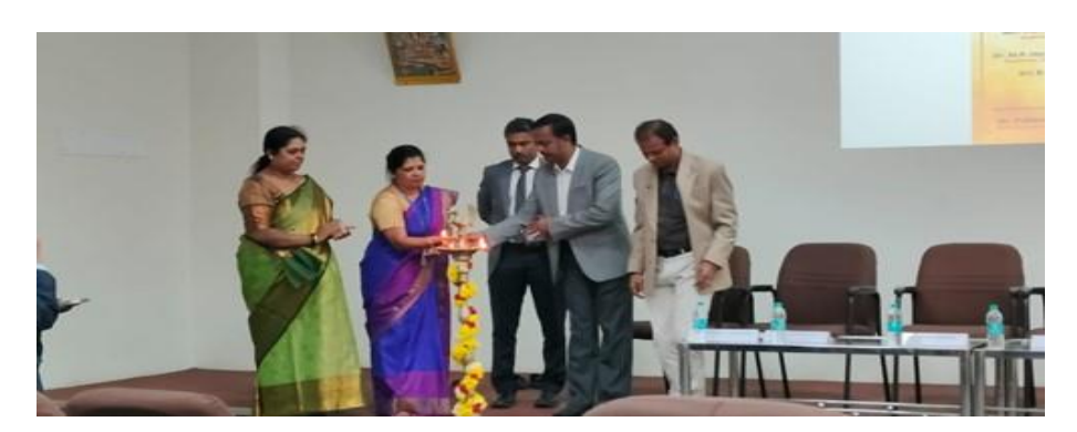
NIPM- KC STUDENT CHAPTER INAUGURATION

The session was organized to help the students learn about the NIPM Karnataka Chapter Student Chapter. Students can undertake learning projects and develop innovative tools, techniques, and new knowledge in collaboration with the working professionals in NIPM. Students can publish professional articles, case studies etc., and develop related skills using NIPM publications. Students can use this forum to exchange ideas and critical learning and collect and disseminate information on Management in general and Human Resource Management, Industrial Relations, Labour Laws, and Labour Welfare in particular.