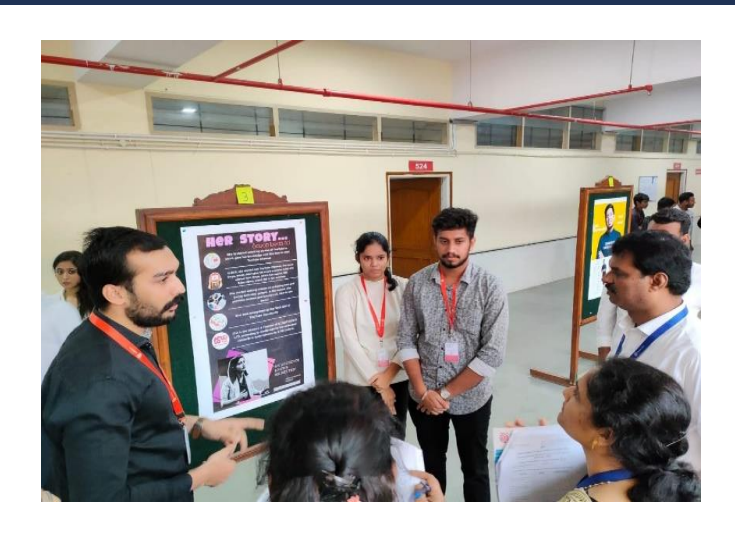
From Zero to Hero: Strong Planning and Hard Decisions will never let your start-up Fail

Students gain experience from talking to budding entrepreneurs. Every business can succeed with strong planning and good timing.