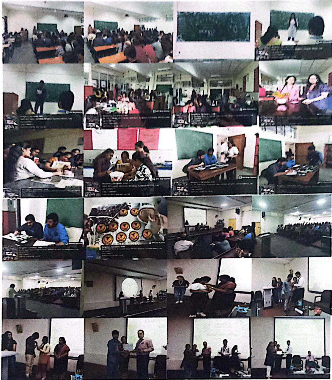
Glimpses of BIOFEST 2K24 – Inauguration, Competitions and Valedictory session

Principal M.S.Ramaiah College of Arts, Science & Commerce-Autonomous MSRIT POST, MSR Nagar Bengaluru - 560 054