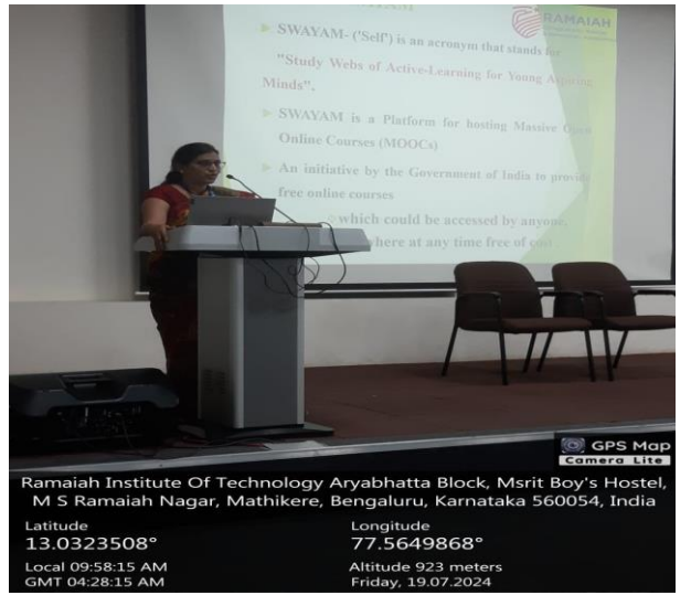
GPS Map Camera Lite Ramaiah Institute Of Technology Aryabhata Block, Msrit Boy's Hostel, M S Ramaiah Nagar, Mathikere, Bengaluru, Karnataka 560054, India Latitude 13.0323508° Longitude 77.5649868° Local 09:58:15 AM Altitude 923 meters GMT 04:28:15 AM Friday, 19.07.2024