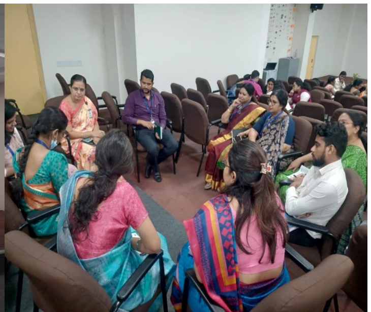
Faculty of MBA Department brainstorming on writing research proposal