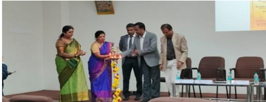
NIPM- KC STUDENT CHAPTER INAUGURATION

The session was organized to help the students learn about the NIPM Karnataka Chapter Student Chapter. Students can undertake learning projects and develop innovative tools, techniques, and new knowledge in collaboration with the working professionals in NIPM. Students can publish professional articles, case studies etc., and develop related skills using NIPM publications. Students can use this forum to exchange ideas and critical learning and collect and disseminate information on Management in general and Human Resource Management, Industrial Relations, Labour Laws, and Labour Welfare in particular.