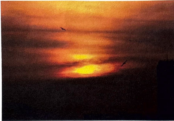
(Syeda Subiya Sugara, BA Ist Sem First Place)